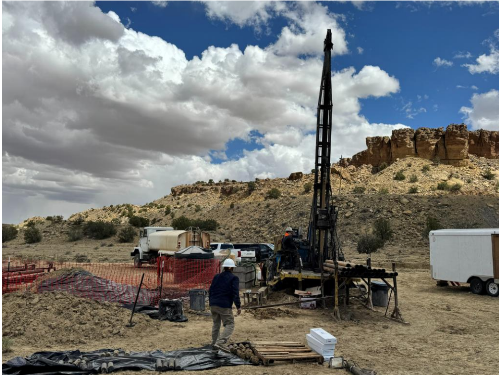
Figure 1: Core drilling underway at Cebolleta Uranium Project