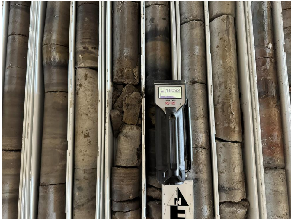
Figure 2: Mineralized PQ core from one of three holes completed thus far, demonstrating excellent recovery, with downhole probe data pending.